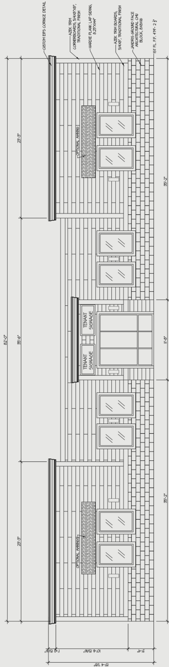
5 FRONT ELEVATION SCALE 1/4" = 1'-0"